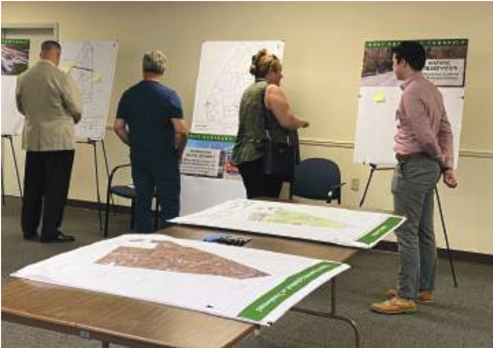
In May 2023, an open house was held to gather resident feedback on a variety of topics covered in the comprehensive plan.

The task force analyzed and evaluated pertinent information affecting land use, housing, connectivity, economic development, environmental resources, parks and recreation, historic preservation, and community facilities in the Township. Recommendations were developed by the task force to meet the challenges and opportunities identified through the planning process, and then shared with the public for review and endorsement.